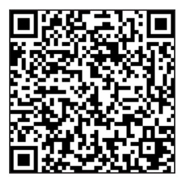
Access PDF of article on other devices